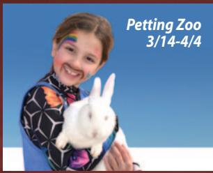
Petting Zoo 3/14-4/4