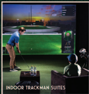
INDOOR TRACKMAN SUITES