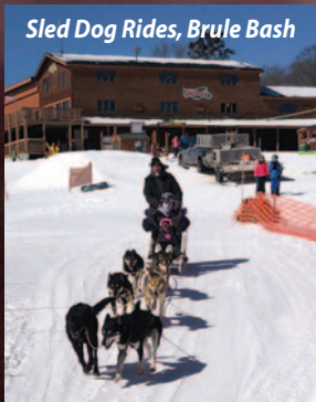
Sled Dog Rides, Brule Bash