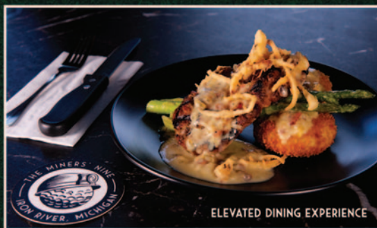
ELEVATED DINING EXPERIENCE