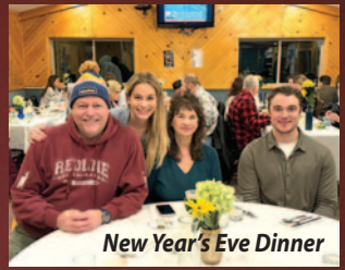
New Year's Eve Dinner