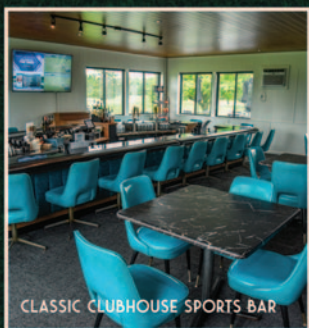
CLASSIC CLUBHOUSE SPORTS BAR