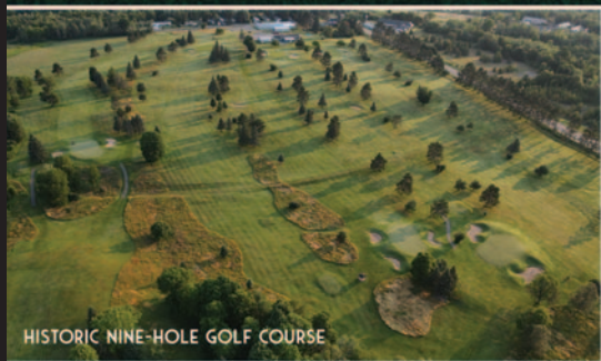
HISTORIC NINE-HOLE GOLF COURSE