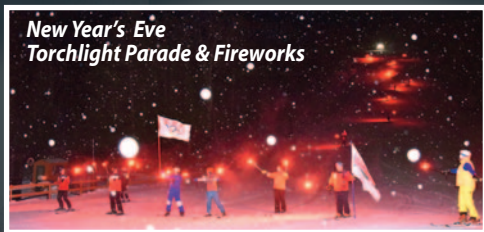
New Year's Eve Torchlight Parade & Fireworks