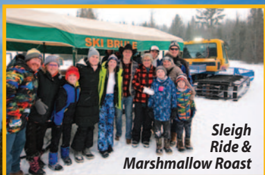
Sleigh Ride & Marshmallow Roast