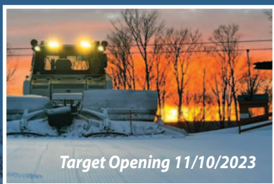
Target Opening 11/10/2023

Ski Brule will provide the best conditions & will be the first to open, with the longest season in the region.