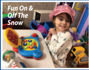
Fun On & Off The Snow