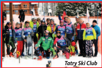
Tetry Ski Club