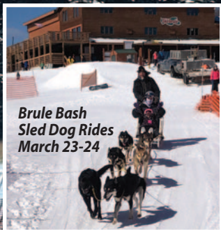
Brule Bash Sled Dog Rides March 23-24