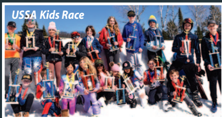
USSA Kids Race