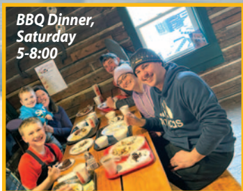
BBQ Dinner, Saturday 5-8:00

Tubing: 5-8:00, $10/prsn, unlimited rides.