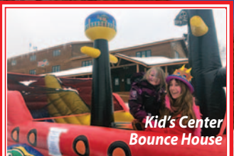
Kid's Center Bounce House