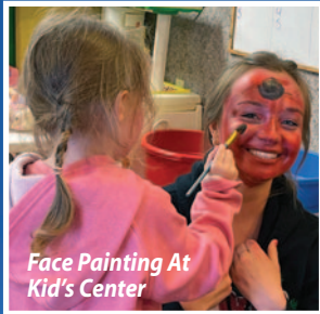
Face Painting At Kid's Center

Start your child on snow at Ski Brule. Their first experience will not only have them skiing, but they will also have the time of their life! Children learn about equipment, walking, sliding, riding the towrope, carrying their gear (so you won't have to) and getting up after a fall. It is three hours of fun on and off the snow. The best part is they learn to ski through fun and games which makes it a positive experience and you won't get frustrated trying to teach your child. Nothing but smiles as children ski, play on the slides, bounce house, & sip hot cocoa.