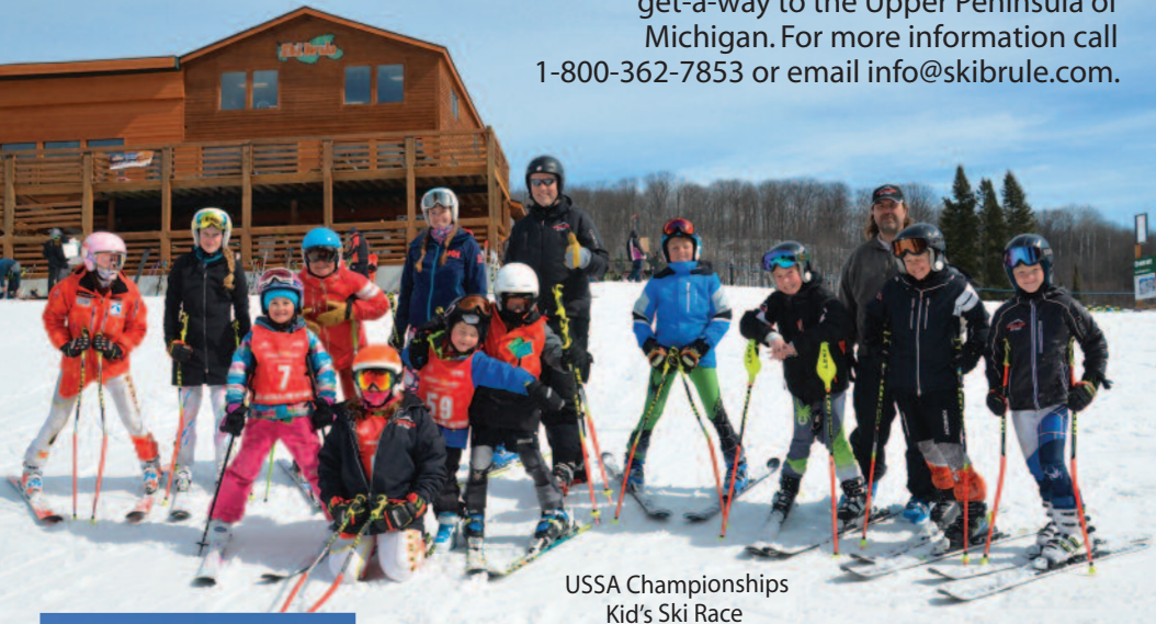
USSA Championships Kid's Ski Race

We are waiting to assist in planning your get-a-way to the Upper Peninsula of Michigan. For more information call 1-800-362-7853 or email info@skibrule.com .