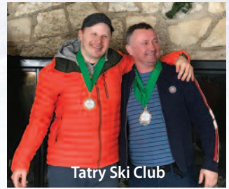
Tatry Ski Club