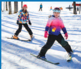
3 Generations Skiing At Ski Brule