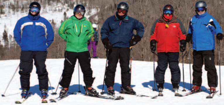
Nordman Crew, Spillway Trail