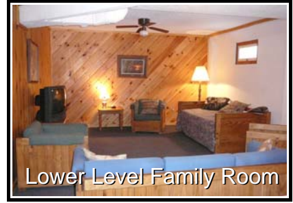
Lower Level Family Room