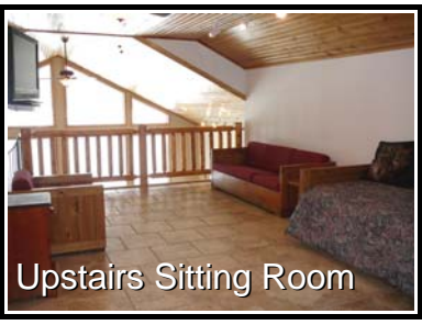
Upstairs Sitting Room